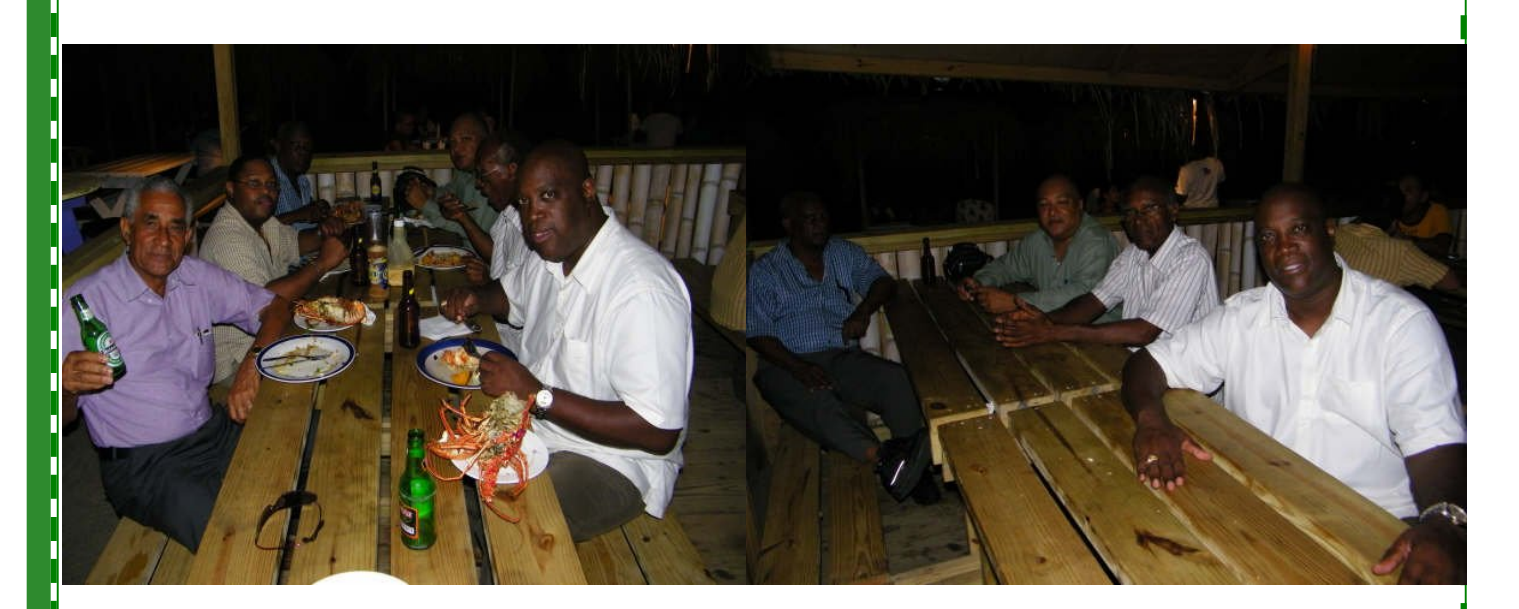
The Brethren at harmony on the beach