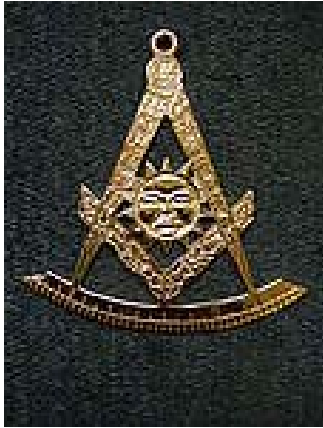
The Jewel of the Right Worshipful Master

PRESENTED AS A MASONIC LECTURE AT THE GLENLYON LODGE REGULAR MEETING NOVEMBER 8, 2006