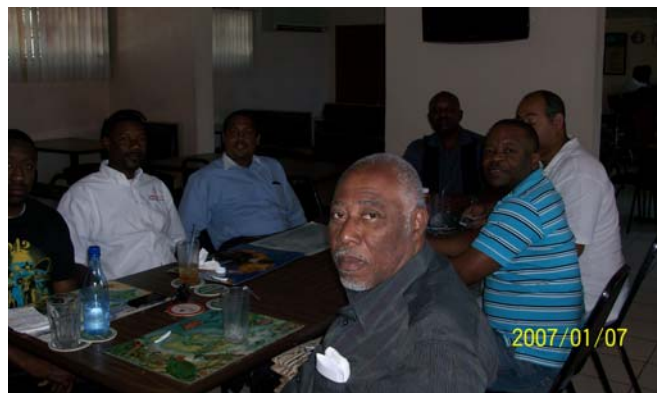
The Brethren "At Table" in The Bahamas