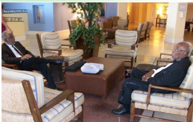
Bros' Ennis and Woodstock before LFN Installation Meeting